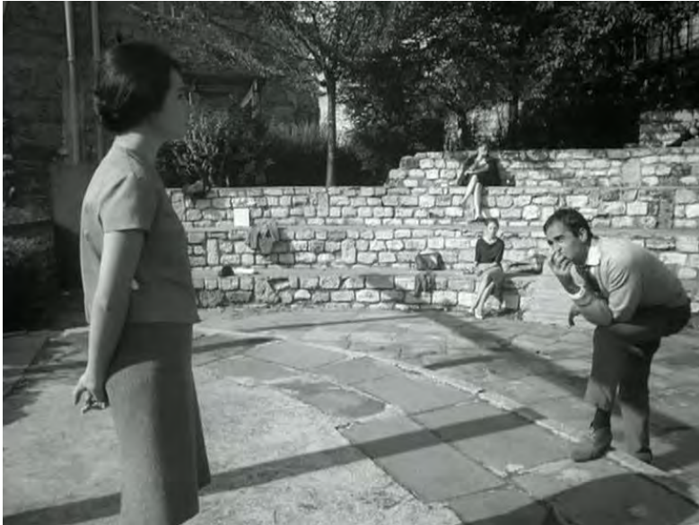
Fig. 2. Rehearsing Pericles

There are many other “spectral” transactions in the film, and quite a few of them involve Terry. One of the most significant instances occurs when Gérard’s amateurish company rehearse in an open-air amphitheatre. While Anne and the actor who plays Leonine speak lines from 4.1. (from “Is this wind westerly that blows?” [49] onwards), the camera insidiously offers a close-up of Terry, which strongly suggests an uncanny juxtaposition between Terry and the play’s scheming Dionyza.